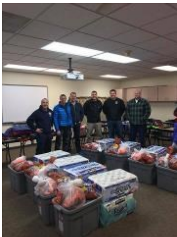
Longview Union Firefighters, Local 828, delivered holiday meals and some other essentials to families at Lower Columbia College Head Start