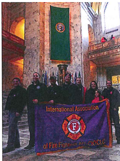
Members of the 9th District