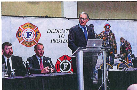
Governor Jay Inslee addressing WSCFF members in January.

The Governor convened the special session March 29, and most lawmakers will return home while budget writers and caucus leaders stay to work on the budget. We anticipate little to no legislative activity until negotiators reach a budget compromise.