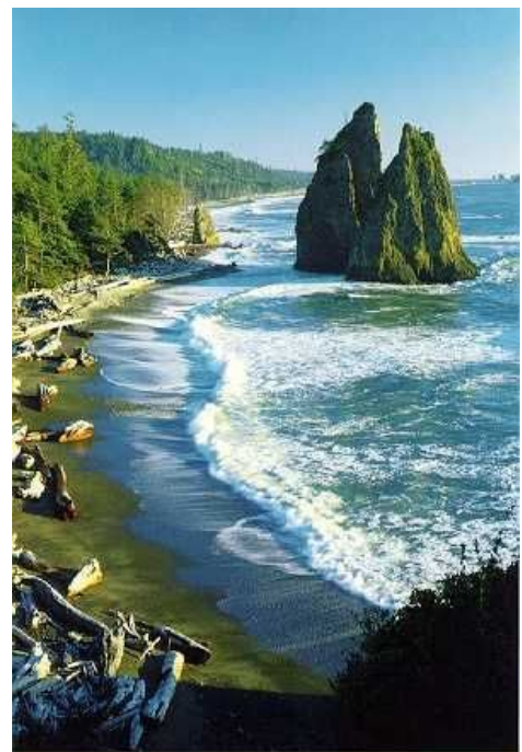
The "Washington Coast Trail" in Olympic National Park

www.wscff.org , washingtonfirefighter.org