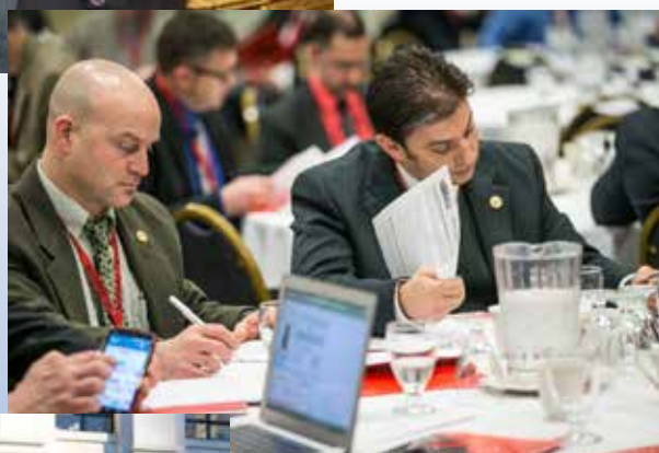
Below: Members from L106 attend legislative briefing