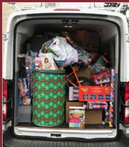
L1747 Toy Drive

Until next time, keep up the great work and stay safe!