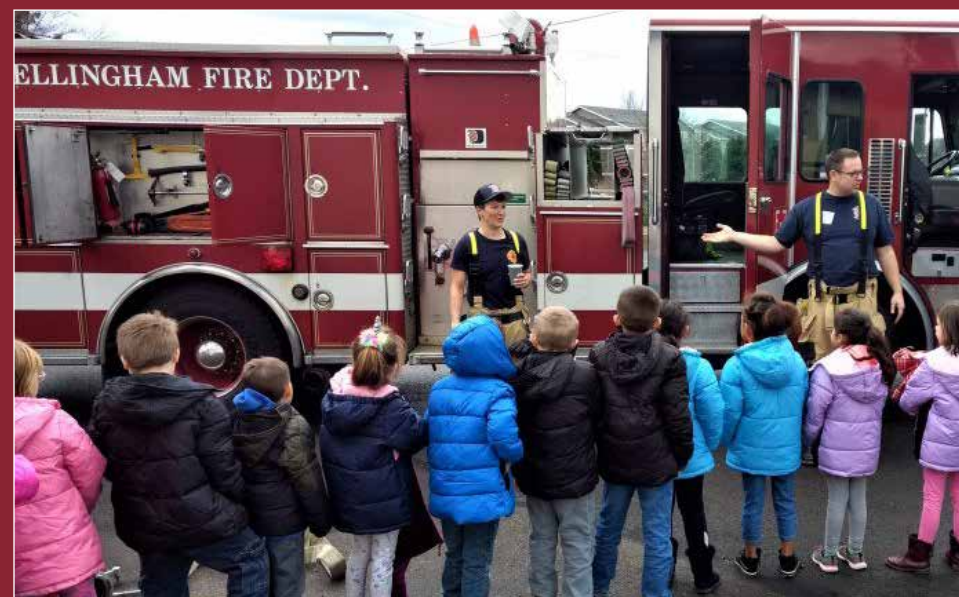
Below: L106 Operation Warm