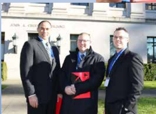
Below: L864 members on their way to meet with legislators