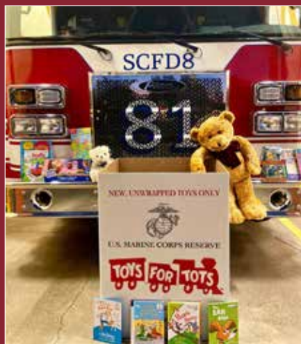
L3711 Toys for Tots