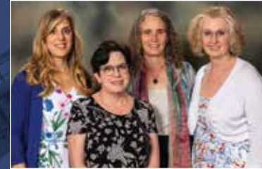
WSCFF STAFF (from L to R)