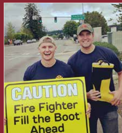
Above: L2819 MDA Fill the Boot