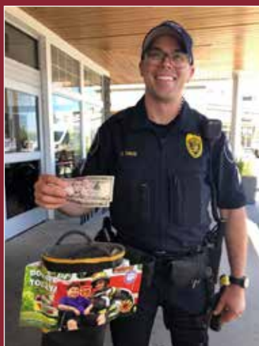
L3482 MDA Fill the Boot

The members of the WSCFF are constantly setting a high bar for “servant leadership” as demonstrated by their actions and sacrifices. There are many instances in which our members are inspired by circumstance – a family member’s illness, a death of a member of the community, or when tragedy strikes.