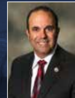
CRAIG SOUCY | 7th District Representative Legislative Districts 1, 5, 11, 32, 33, 34, 36, 37, 41, 43, 45, 46, 47, 48 Locals 864, 1604, 1762, 2099, 2545, 2829, 2898, 2950, 3740 Congressional Districts 1, 7, 8, 9