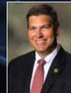
KEVEN ROJECKI | 9th District Representative Legislative Districts 2, 11, 21, 27, 30, 33, 34, 37, 38, 47 Locals 1257, 1461, 1747, 2024, 2088, 4189, I-66 Congressional Districts 2, 7, 8, 9, 10