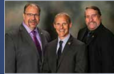
WSCFF TRUSTEES (from L to R)