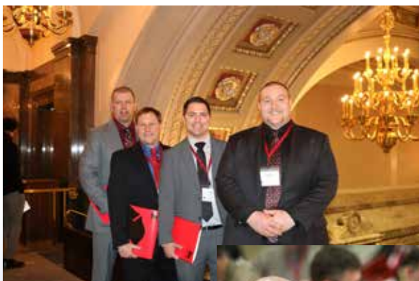
Left: WSCFF 2nd District Members visit the Capitol

Legislative Conference February 4–5, 2020. If you've never attended, the conference is a great way to learn about what your union does for you and to meet and learn from members across the state. Locals can register attendees at wscff.org . In addition, you are welcome to contact the Legislative Team to spend a day in Olympia to help us improve the lives of our members.