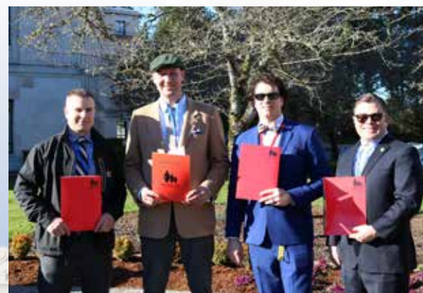
Left: L27 members pause for a photo

Registration is $50, and the WSCFF offers subsidies to help members from small locals attend. Contact your local leaders for more information.