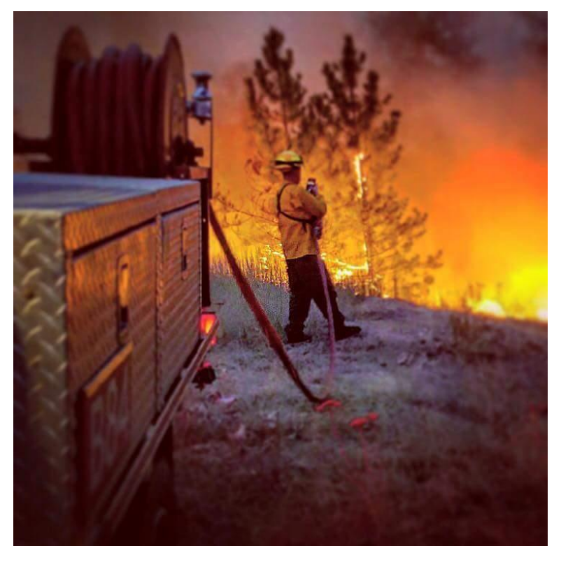
Thank you for participating